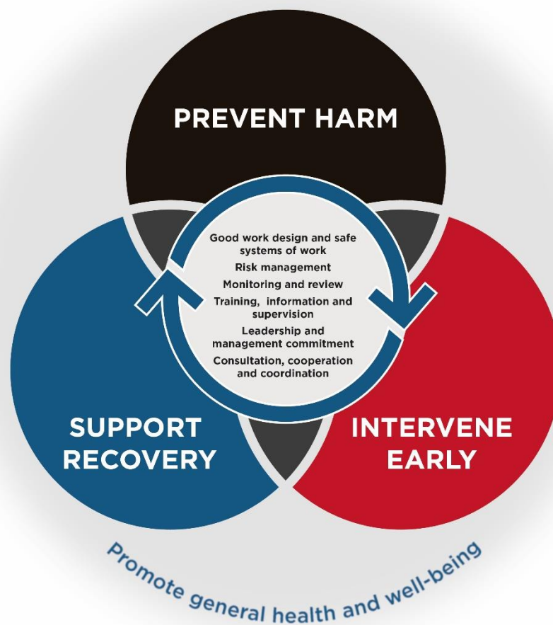
Figure 1. Systematic approach to psychological health and safety

Prevent harm – This element focuses on your duties under WHS laws. To do this you must systematically and comprehensively: