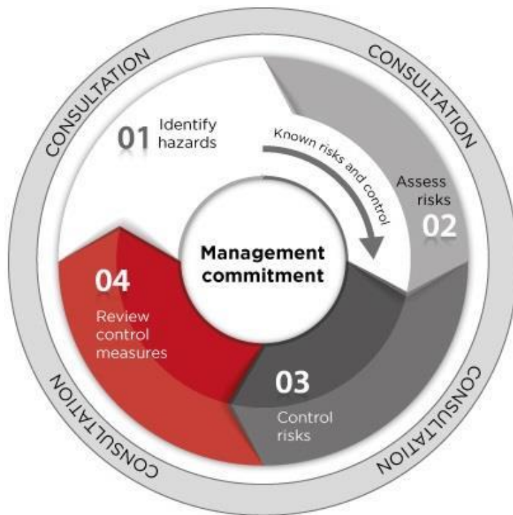
Figure 2. The risk management process

This process will be implemented in different ways depending on the size and nature of your organisation. Larger businesses or those where workers are exposed to more, or more serious psychological health and safety risks may need more complex and sophisticated risk management processes.